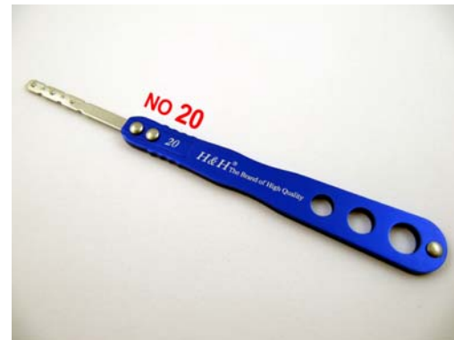
No.20: Pick-Computer Key Rake