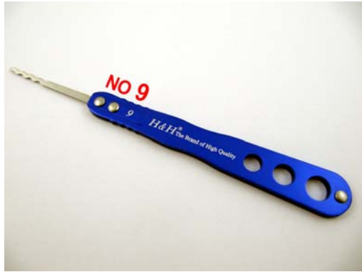
No.9: Pick-Slim Wave Rake