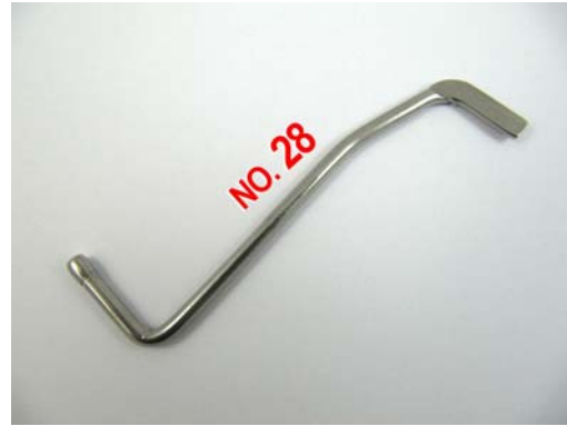
No.28: Tension wrench-Thicken 3.0mm