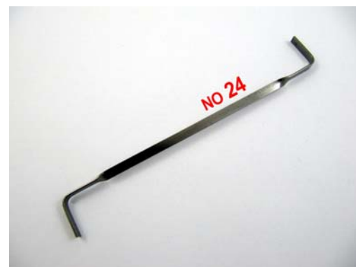
No.24: Tension Wrench