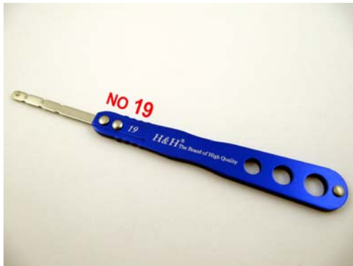
No.19: Pick-Computer Key Rake