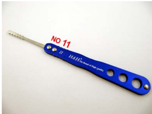
No.11: Pick-Small Wave Rake