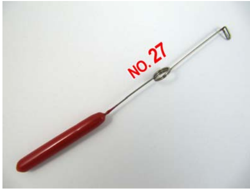
No.27: Spring Tension Tool