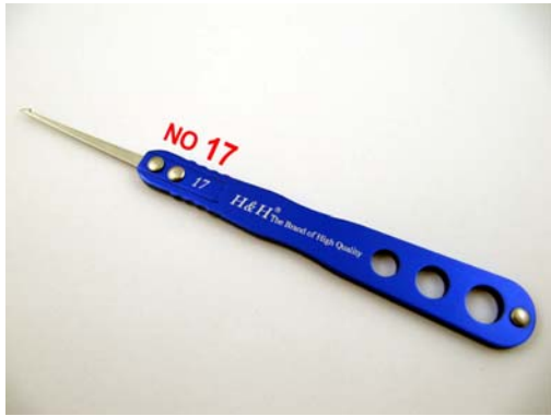
No.17: Broken key extractor