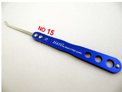
No.15: Pick-Long Diamond