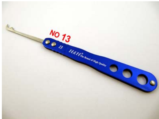
No.13: Pick-Incline Double Barb