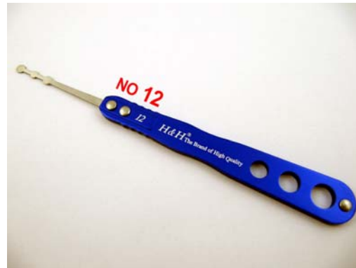
No.12: Pick-Triple Ball Rake