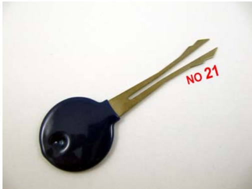
No.21: Slim Wafer Pick