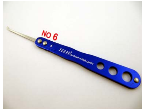
No.6: Pick-Small Hook