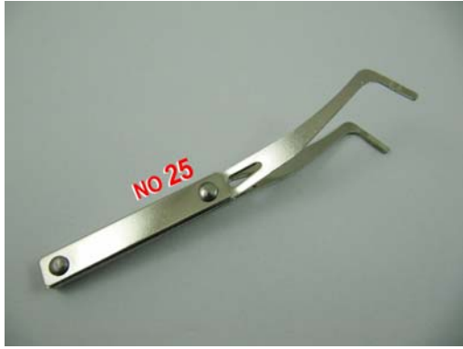
No.25: Professional Auto Tension Tool