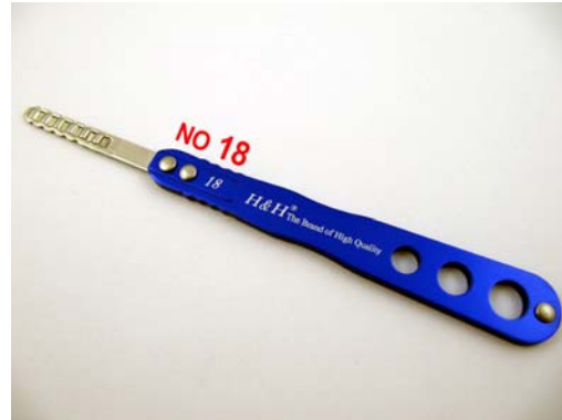
No.18: Pick-Computer Key Rake