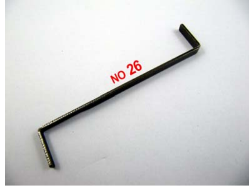
No.26: Tension Wrench