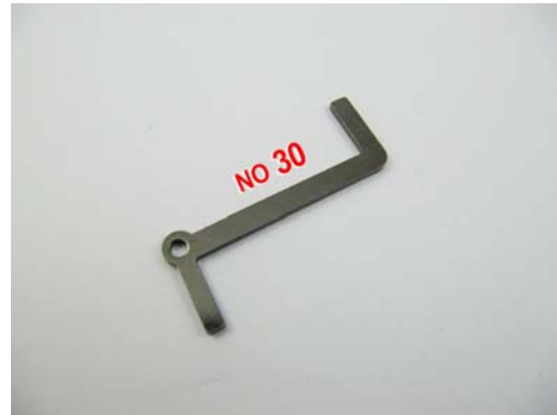
No.30: Convenient Tension Tool