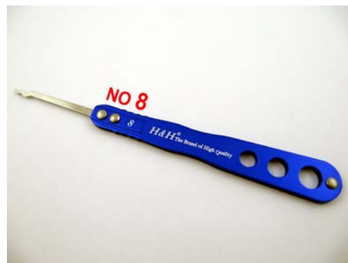
No.8: Pick-Two Wave Rake