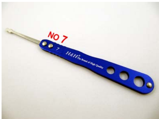
No.7: Pick-Double Ball