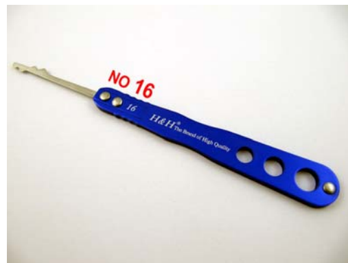
No.16: Pick-Half Ball Rake