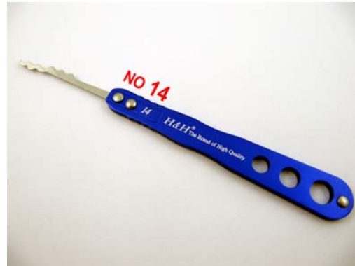
No.14: Pick-Special Wave Rake