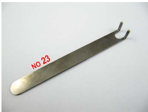
No.23: Double-Sided Tension Wrench