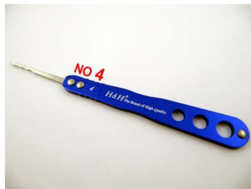
No.4: Pick-Triple Wave Rake