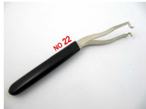
No.22: Auto Tension Tool