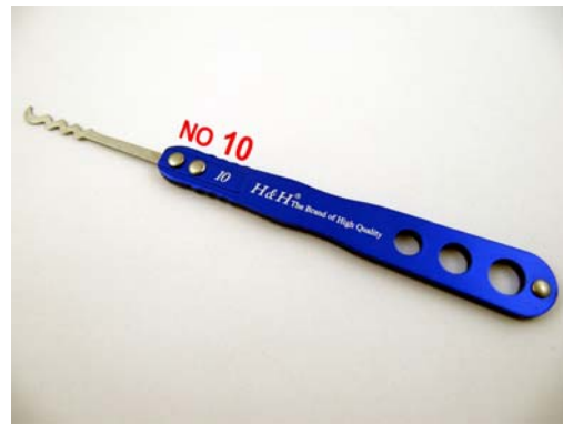
No.10: Pick-Big Wave Rake