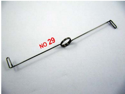
No.29: Double-Sided Spring Tension Tool