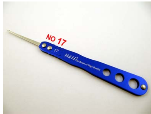
No.17: Broken Key Extractor