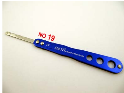
No.19: Pick-Computer Key Rake