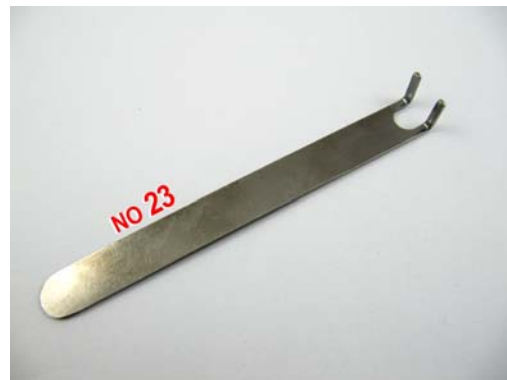
No.23: Double-Sided Tension Wrench