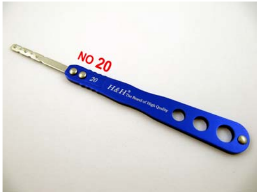
No.20: Pick-Computer Key Rake