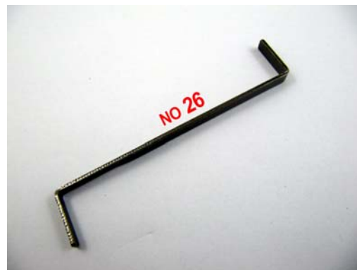
No.26: Tension Wrench