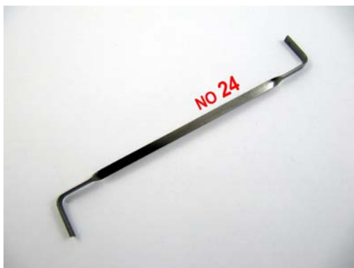
No.24: Tension Wrench