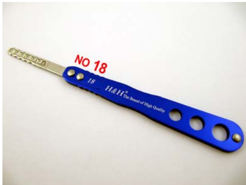
No.18: Pick-Computer Key Rake